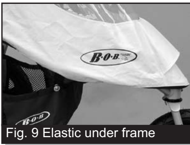
Fig. 9 Elastic under frame